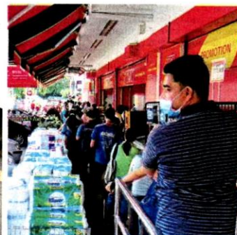
Orang ramai membeli barang keperluan di sebuah pasar raya di Bangsar berikutan pelaksanaan PKPB di Kuala Lumpur.