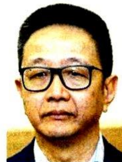
Datuk Teng Chang Khim

“We believe the sector will pick up once all international borders are reopened.”