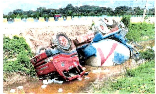
Lori konkrit terbabas dan memasuki parit yang mengalir ke Sungai Selangor.

Katanya, Pengurusan Air Selangor Sdn Bhd (Air Selangor), Jabatan Alam Sekitar (JAS) Selangor dan Majlis Daerah Kuala Selangor (MDKS) turut membantu menjalankan pemantauan dan siasatan bagi menangani insiden berkenaan agar tiada