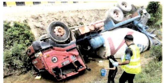
Sebuah lori konkrit terbabas masuk ke kawasan alur Kolum KL-Larut di Bestari Jaya pagi semalam.

"Tindakan pantas LUAS berjaya mengelak daripada henti tugas loji rawatan air (LRA) dan tiada gangguan bekalan air kepada pengguna," katanya.