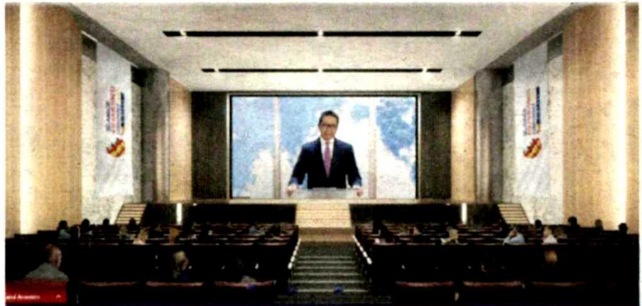
TENG pada pelancaran Selangor International Business Summit yang dilakukan secara maya.

Mengakui angka terbabit lebih rendah berbanding sasaran, Teng bagaimanapun menyifatkan ia sebagai cukup memuaskan dengan mengambil kira situasi pandemik Covid-19 yang membawa kepada pelaksanaan pelbagai peringkat Perintah Kawalan Pergerakan (PKP)