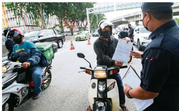
In black and white: Motorists showing their authorisation letters to police personnel from IPD Ampang Jaya during a roadblock near Taman Cheras Indah.

"For example, if you live in Banting but work in Putrajaya, there is no need to get