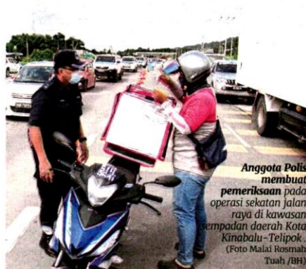
Anggota Polis membuat pemeriksaan pada operasi sekatan jalan raya di kawasan sempadan daerah Kota Kinabalu-Telipok.

"Aktiviti pengimarahannya seperti kuliah Maghrib, kuliah Subuh dan kuliah Duha serta aktiviti agama lain juga hendaklah ditangguhkan buat sementara, berkuat kuasa pada waktu Subuh hari ini (semalam)," katanya.