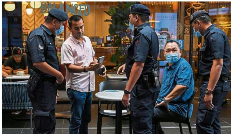
Ensuring compliance: Police officers checking the registration and entry information of the public in Kuala Lumpur.

announcement of a statewide conditional MCO, weddings are no longer allowed," said AMM.